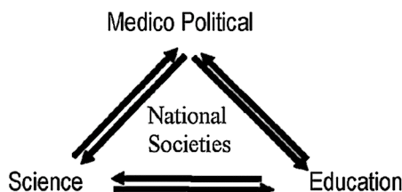
Fig. 1: The FIMM triangle-model

The motion and the adoption of the changes of the bylaws passed unanimously after an extensive discussion. The establishment of the FIMM International Academy of Manual/Musculoskeletal Medicine in 2004 (Bratislava) gave Science with respect to Manual/Musculoskeletal Medicine a newly defined and well prepared home 1 . Educational matters achieved the same in FIMM's Education Board 2 . For many reasons the General Assembly became aware that medico-political issues have become eminent and, therefore, agreed to establish structures within FIMM that are compatible with these demands. The Assembly was thereby strongly convinced by the triangle-model prior introduced by the Science Director of the FIMM Academy including a statement in 2005 3 :